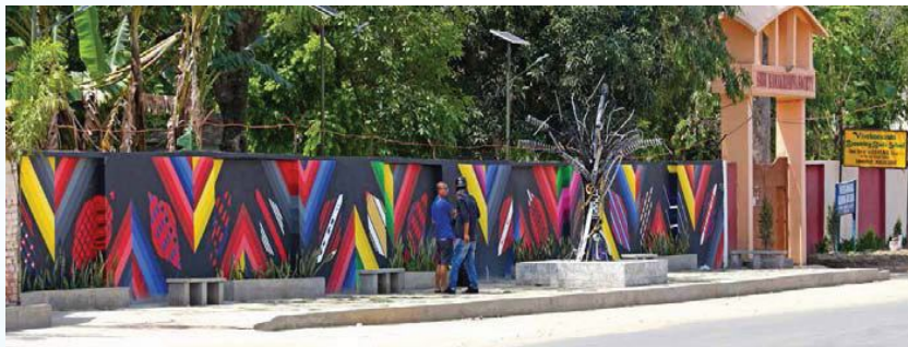
Before & After project Area: Supply Colony