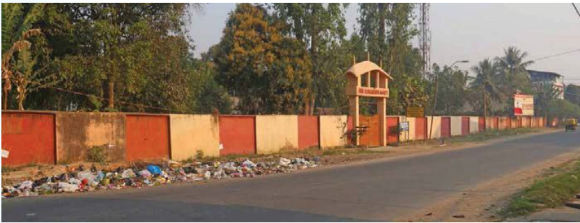
Before & After project Area: Duncan road

To cite a few examples of transformation of public spaces, the area near along the main road in Duncan Basi used to be filled with garbage but has now been converted into a beautiful space with murals of Naga shawls painted along its walls. A symbolic tree called “existence” constructed out of metal scraps and made by a local artist also stands in the middle adding to the beauty of the place. Another example of such transformation of landscape has been done at supply colony which consists of a waiting shed and two gigantic hands sculpted out of metal.